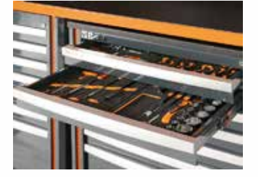
Drawers can accommodate thermoformed tool trays

Aluminium shutter with lock for protecting tools